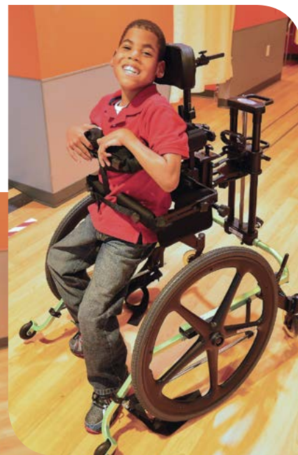
(above) State-of-the-art gait trainers and other adaptive equipment help patients improve functional mobility, even if they are unable to walk.